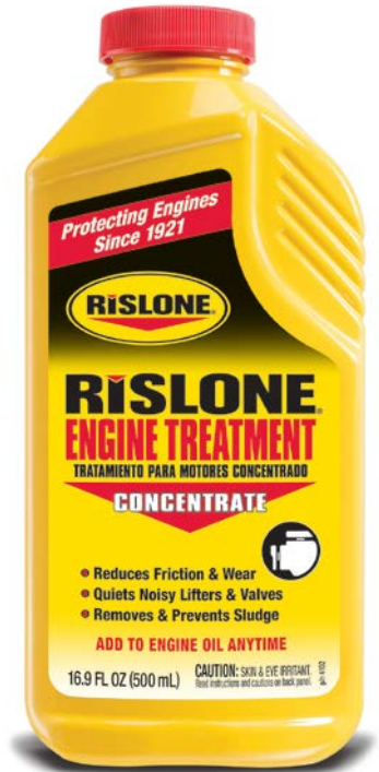
Part Number: 4102 Bottle Size: 500ml